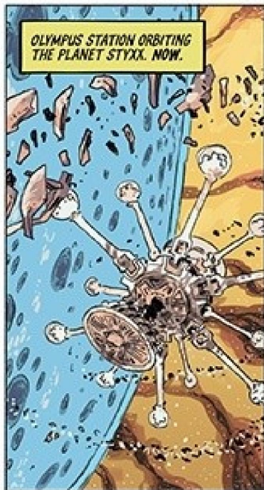
OLYMPUS STATION ORBITING THE PLANET STYXX. NOW.